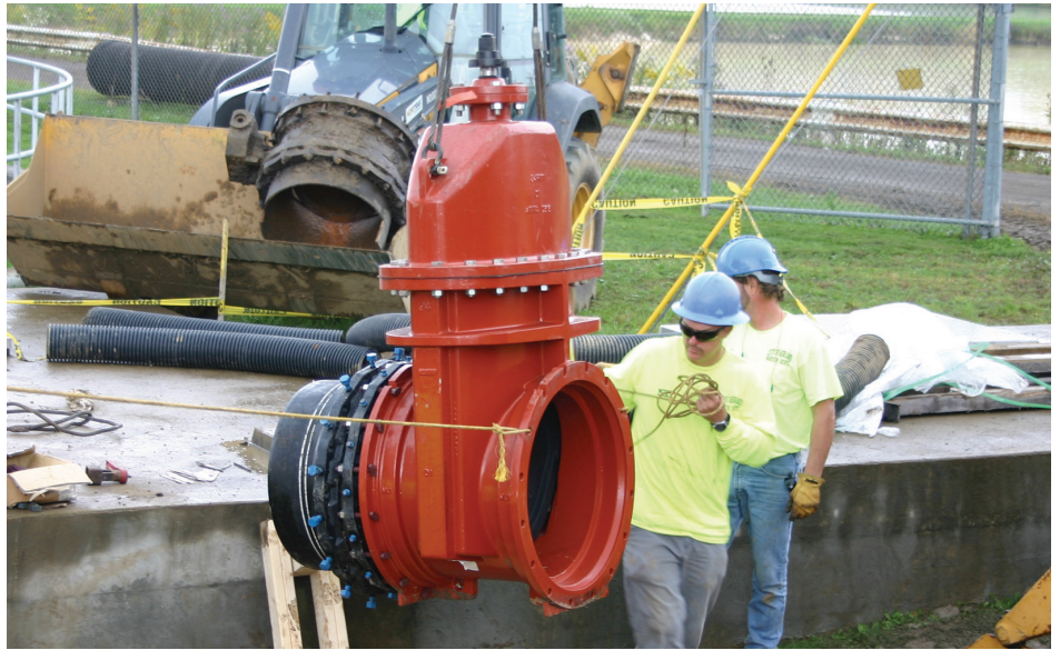
Installation of 24" Resilient Wedge Gate Valve